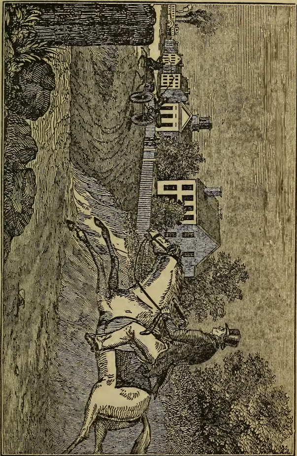
THE FATHER IN PURSUIT OF THE PRIEST.—Part III., p. 113